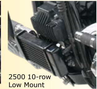
2500 10-row Low Mount