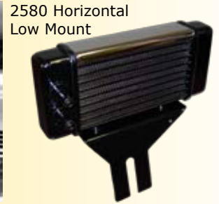
2580 Horizontal Low Mount