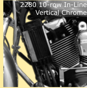
2280 10-row In-Line Vertical Chrome