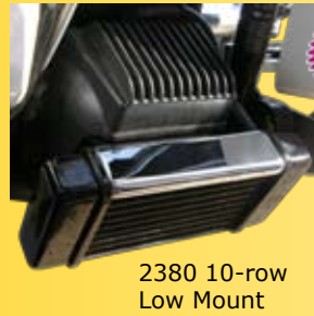
2380 10-row Low Mount