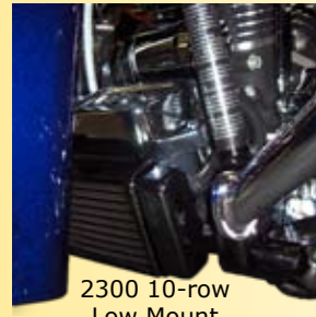
2300 10-row Low Mount