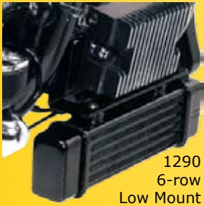
1290 6-row Low Mount